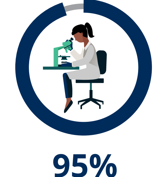
Labs are physician office labs, independent labs and other local labs

Network reliability, security, and simplicity are critical success factors for distributed points of care.