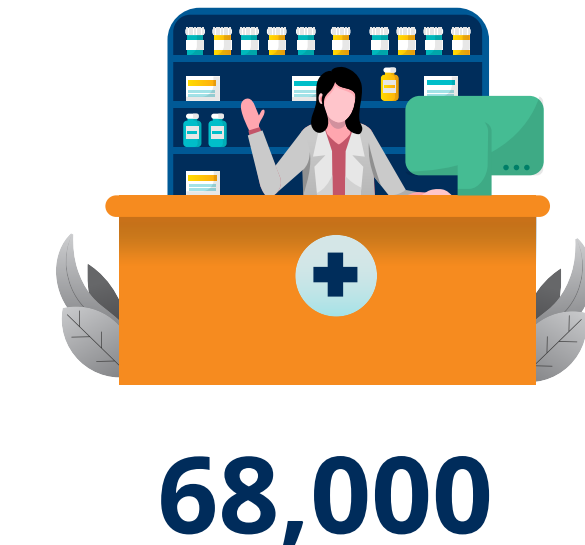
Community pharmacies (independent and retail chains), of which 1/3rd are independent